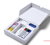
(STARTERKIT) STARTERKIT STARTERSET