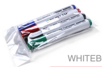
(SETFIXWB) MARKER PENS WHITEBOARDMARKER-SET